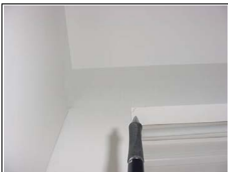
Bedroom – Minor hairline crack due to drying out of internal finishing material