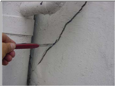
Checking depth of crack - Bottom of crack