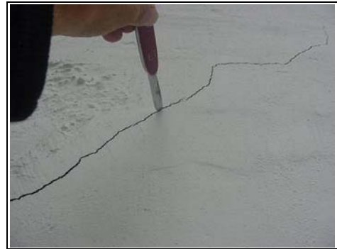
Checking depth of crack – Top section