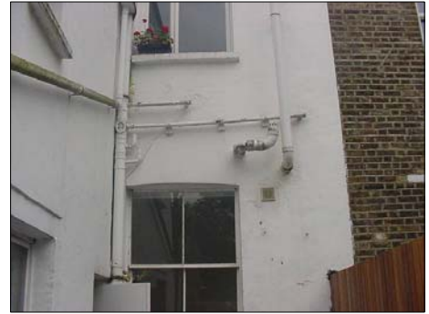
Diagonal cracking to left hand side of window