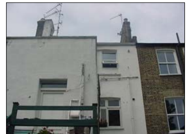
High level rear view