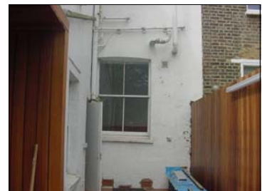
Low level rear view

We have used the term 'assumed' as we have not opened up the structure.