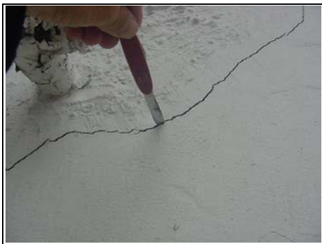
Checking depth of crack - Upper middle section