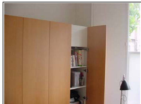
Adjacent cupboard is lined, so we did not have access to the wall structure.